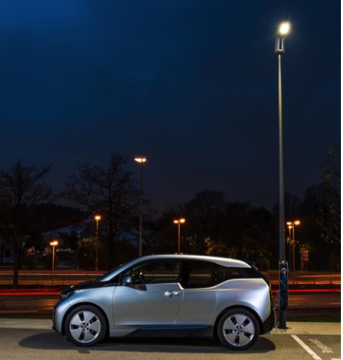
Figure 3: Example EV streetlight charging station by BMW

In 2006, the City of London partnered with The Cloud, a wireless network operator, to launch a free public Wi-Fi program in London's business and financial centre. Hotspots are installed on street furniture, including streetlighting poles, and have provided service for over 50,000 users. The cloud recently completed a full network upgrade, increasing the wireless capacity by four times and becoming the largest gigabit Wi-Fi network in Europe.<sup>20</sup>